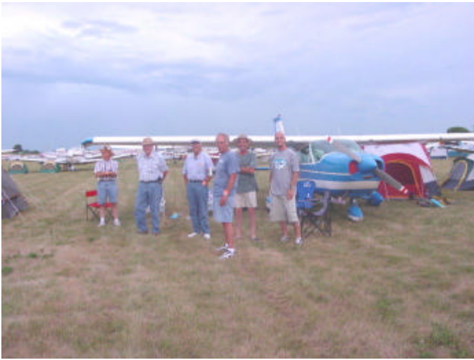
Must have been something really good to get all these guys to arise from their normal sitting position.