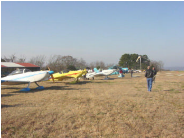
Some of the airplanes at the Wild Onion Breakfast