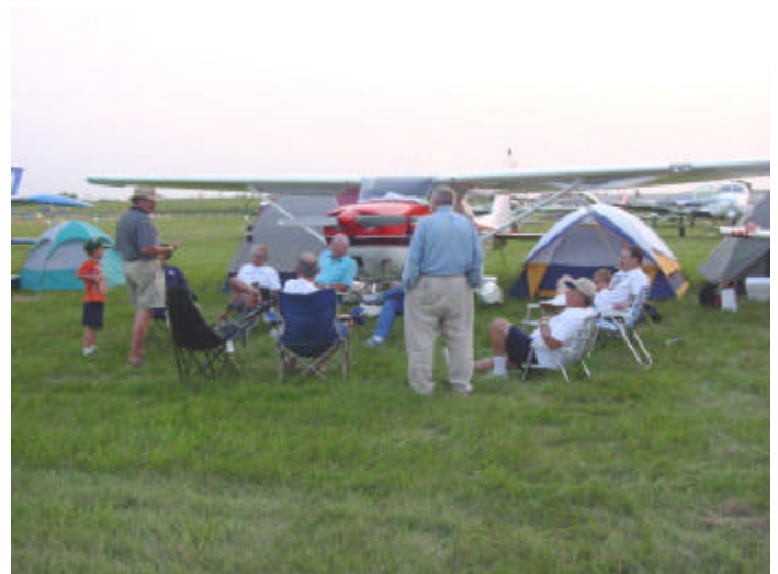
Chapter 10 in action at Oshkosh