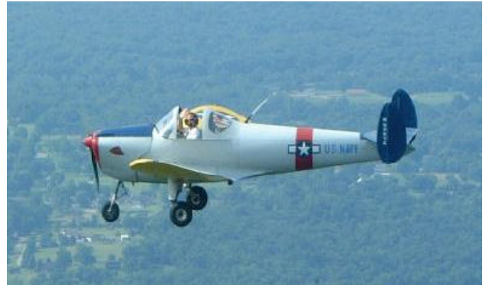
Our leader saying “howdy boys”